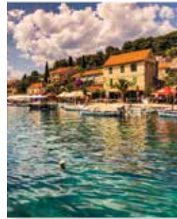
Central & Eastern Europe