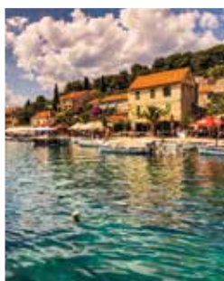
Central & Eastern Europe