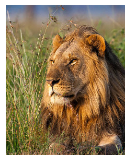
Kenya & Tanzania