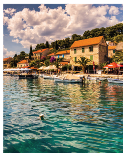
Central & Eastern Europe